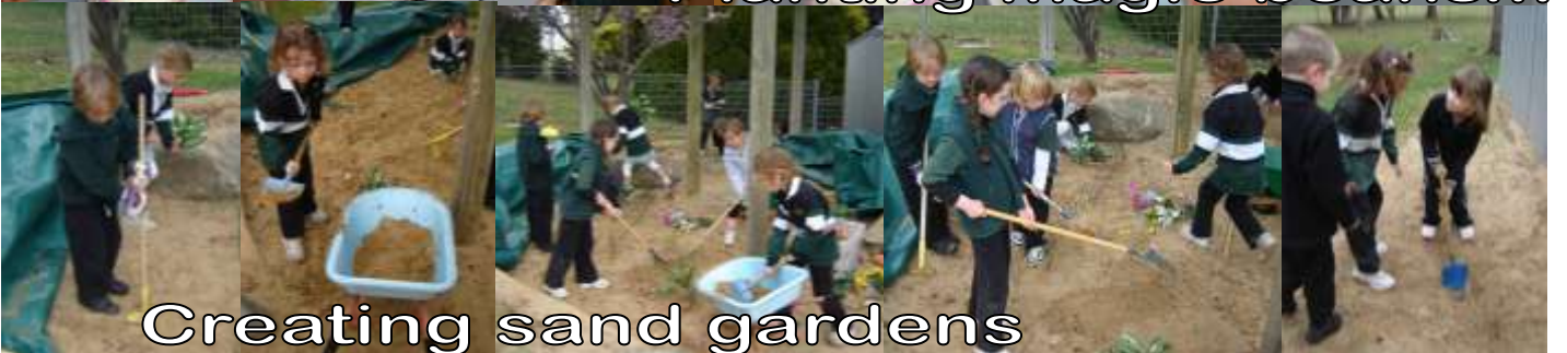
Creating sand gardens