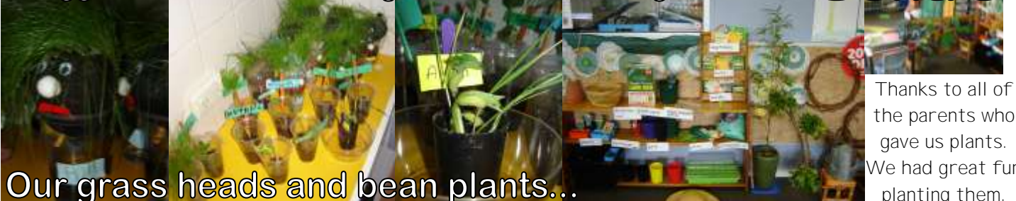
Our grass heads and bean plants...

Thanks to all of the parents who gave us plants. We had great fun planting them.