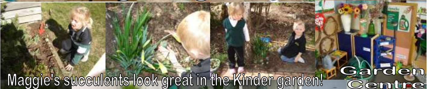
Maggie's succulents look great in the Kinder garden!