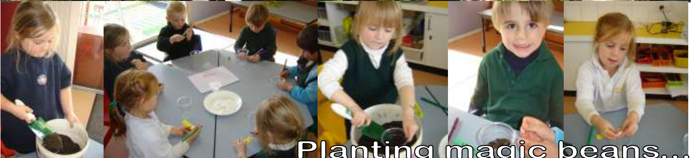
Planting magic beans...